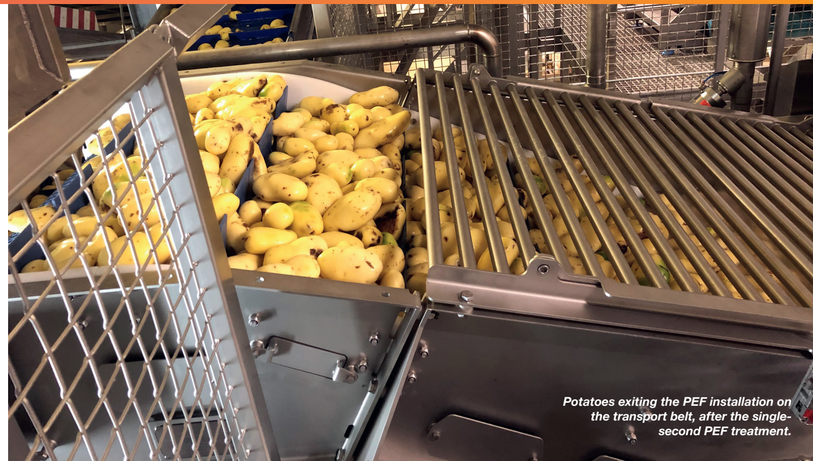
Potatoes exiting the PEF installation on the transport belt, after the single-second PEF treatment.

Potato treatment with PEF, to treat whole potato tubers at a capacity of up to 60 tonnes per hour to make French fries, involves two main parameters. "You can treat potatoes peeled or unpeeled. However, to connect the electric field with the potato, treatment in water is required. You have two parameters: the electric field strength in kilovolts per centimeter and the specific energy in kilojoules per kilogram of potatoes and water. A threshold value is required for the field strength to create holes in the membranes. Think of it this way: In early potatoes, say in the first six or seven months of the season, the cell pressure is high and they are hard. To drill the holes in the membranes in the first place, you need a higher field strength during that time than during the last five or six months of the season," De Boevere says. "The generators we use have an output voltage, in our case 30 kilovolts, that creates a certain field strength in an opening between the electrodes. The pulsed current flows from a plus electrode to a minus electrode. Between them is the mixture of potatoes and water. Since the Pulsemaster systems have a higher output voltage and more specific energy, the customer has more degrees of freedom to choose the right treatment throughout the year. So you can adjust the field strength at the beginning or end of the season to the different hardness levels of the potato."